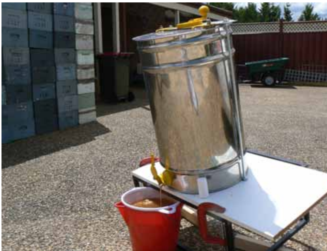
Figure 7 Extracting the honey for residue analysis.

In accordance with the APVMA Guidelines (APVMA 2001) the honey from the twelve frames was pooled. Subsequently six sub-samples were poured into clean, labelled glass jars and frozen. Wax from the cappings that floated on top of the honey was also collected into sample jars. The jars containing the honey and wax were then frozen prior to despatch to AgriSolutions Pty. Ltd. at Deception Bay, Queensland as coded samples. AgriSolutions conducted fiprole extractions of sub-samples from each jar by dissolution in hot water followed by liquid/liquid partitioning with dichloromethane after cooling. The extracted liquids were passed through a 0.45 \mu\text{m} PTFE filter prior to analyses for total fiprole (fipronil and toxic metabolites) via GC/MS/MS.