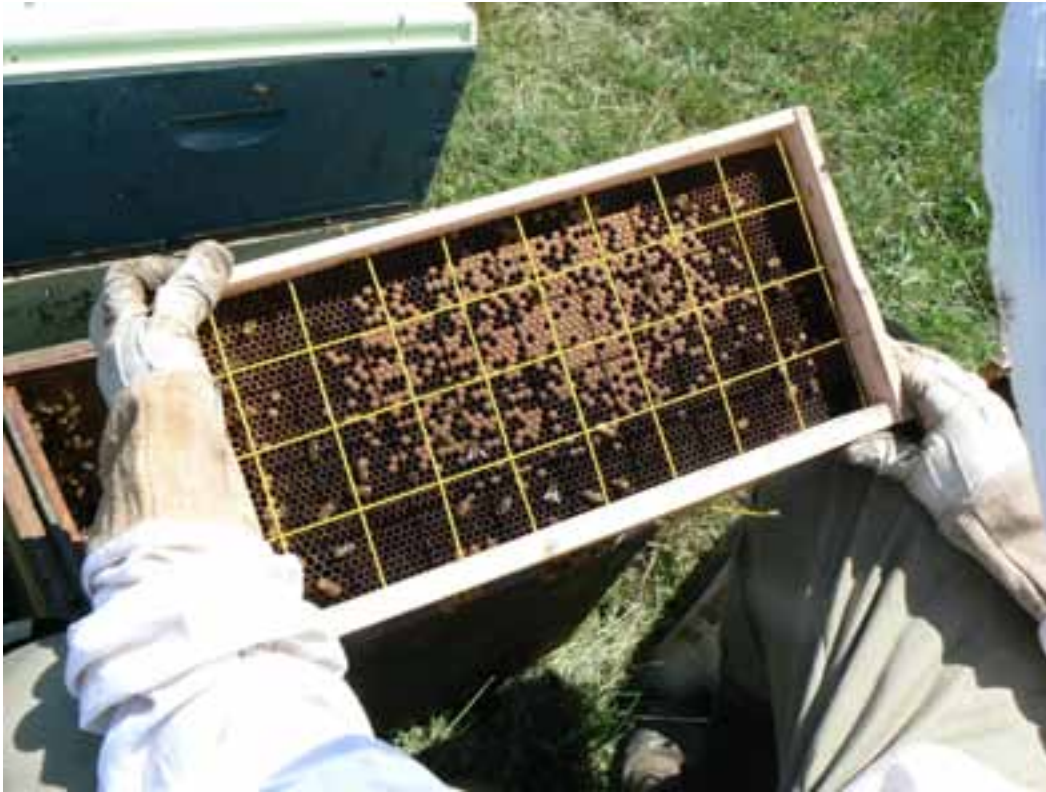
Figure 4 Estimating the brood area on a hive frame.