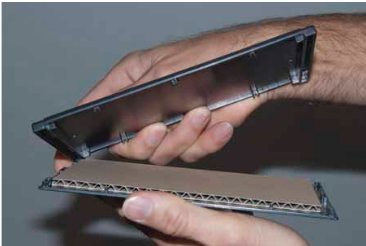
Figure 2 APITHOR™ small hive beetle harbourage prior to final assembly and sealing.