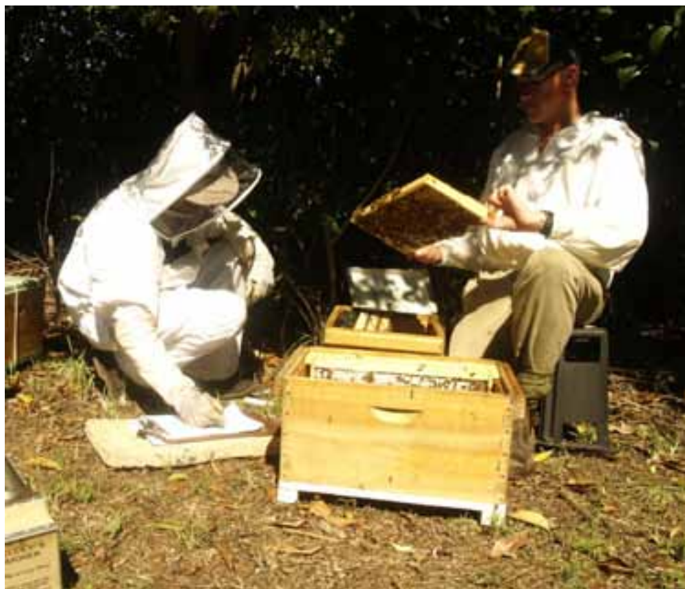
Figure 10 Inspecting hive frames for small hive beetles and recording results.

together with the numbers dead inside the harbourages were recorded. These figures may not represent the total number of beetles killed by the treatments as bees may have removed some dead beetles from the hives.