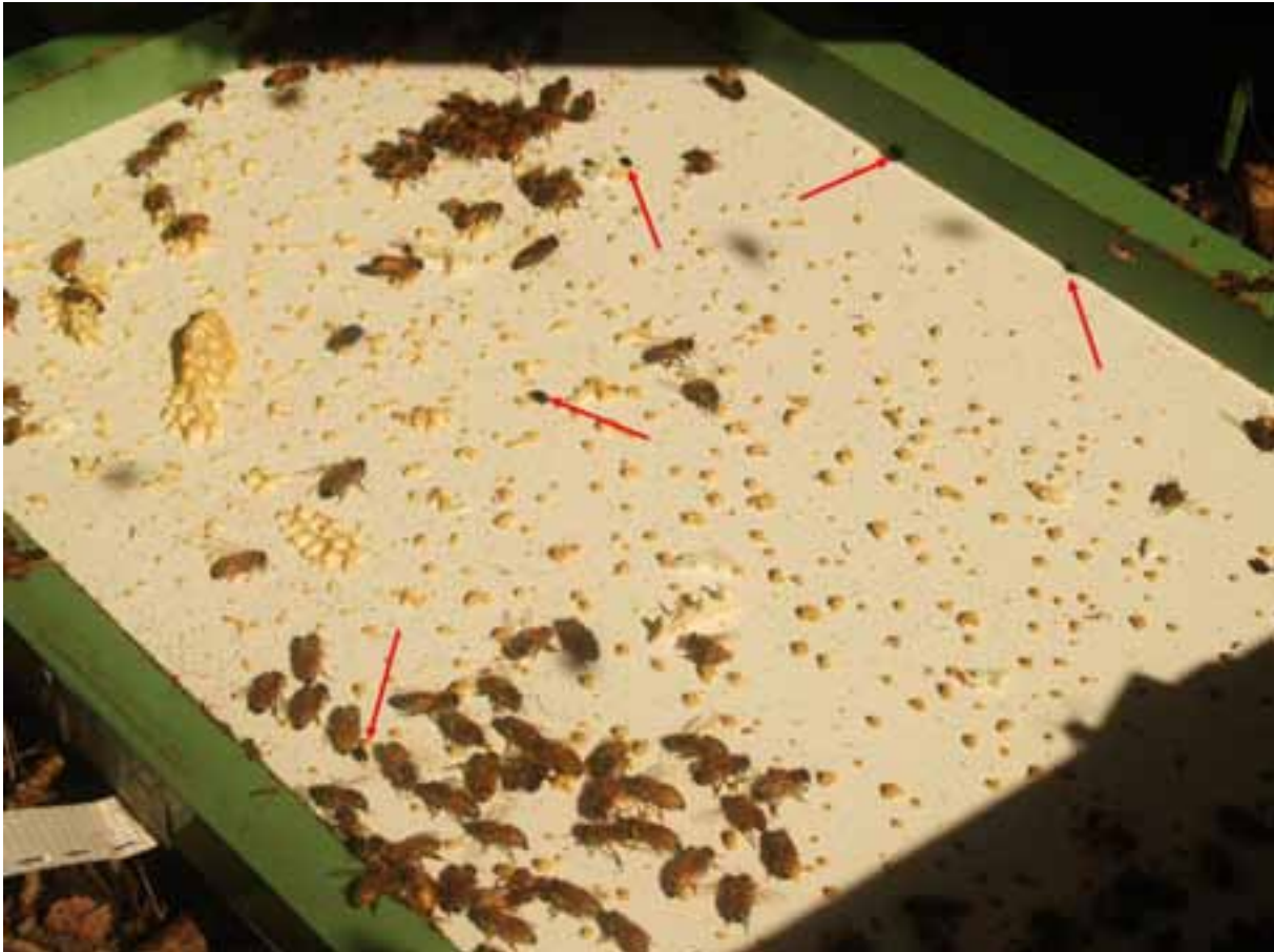
Figure 9 Several beetles (indicated by arrows) on the upturned lid of a ‘control’ hive.

smoked prior to their individual removal from the brood box. They were briefly inspected and placed into a spare hive box (Figure 10). The beetles remaining in the brood box were counted by drawing a 75mm wide metal spatula slowly across the bottom board and walls to move bees and disturb beetles that were harbouring within the hive box. Meanwhile the combination of smoke and light drove beetles from the frames in the second hive box onto the bottom board where they were counted and recorded (Figure 10). The new hive box containing the frames was then placed back onto the original bottom board and the lid replaced.