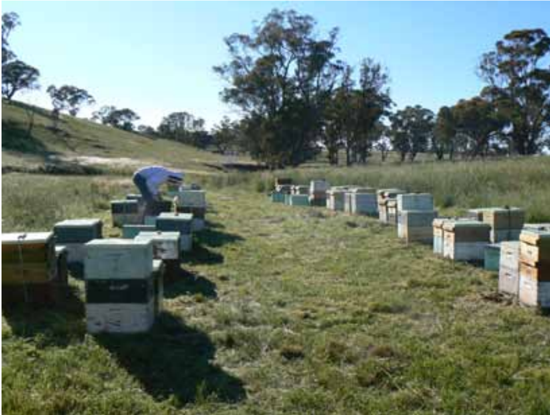
Figure 3 The Cootamundra apiary where the residue and safety trials were conducted.

Residues in Honey (APVMA 2001). Six hives selected on the basis of their similar health status and strength, were assigned to the trial. Each was assessed for the number of frames of bees, hive weight and the area of brood. To assess brood area a frame containing a 5 x 5 cm grid was overlain on the individual frames containing brood and the number of squares with brood recorded (Figure 4). This number was converted to square centimetres of brood by multiplying by 25. Before weighing the hives, a single APITHOR™ harbourage was installed on the bottom board of each hive (Figure 5) and two central frames were removed from the super and replaced by new foundation. This ensured that honey subsequently removed from these frames had been collected and ripened while the harbourage was in place. Each hive was moved on a trolley to a mobile weighing platform that comprised a pair of Ruddweigh™ load bars and a digital display (Figure 6). After weighing each hive was moved back to its respective position within the apiary.