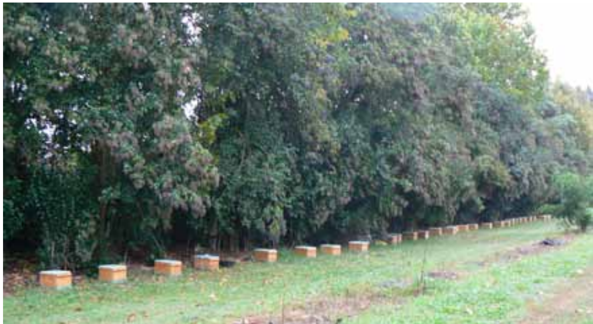
Figure 8 The Richmond apiary where the field efficacy trial was conducted.

This trial was conducted at an apiary (Figure 8) at Richmond, NSW. In 2002 Richmond was the site of the initial discovery of small hive beetle in Australia (Fletcher and Cook 2002) and has maintained a high endemic population of beetles ever since. Thirty new, lightly beetle infested, single box hives with sister queens and similar worker bee numbers were transported to Richmond two weeks prior to the commencement of the trial. The bottom boards had been painted white to facilitate the counting of beetles. Seasonal conditions were not ideal for the bees with few nearby plants flowering during the trial interval. For the duration of the trial each hive contained a syrup (100 g L -1 sucrose solution) feeder in place of the terminal frame in the brood box to provide supplementary nutrition for the bees. The hives were arranged in a single line and oriented to face north. One week before the trial commenced the hives were checked and bee numbers manipulated to make the hives as similar as possible in terms of strength. During this preparatory phase, beetle numbers within the hives increased by immigration from the immediate vicinity.