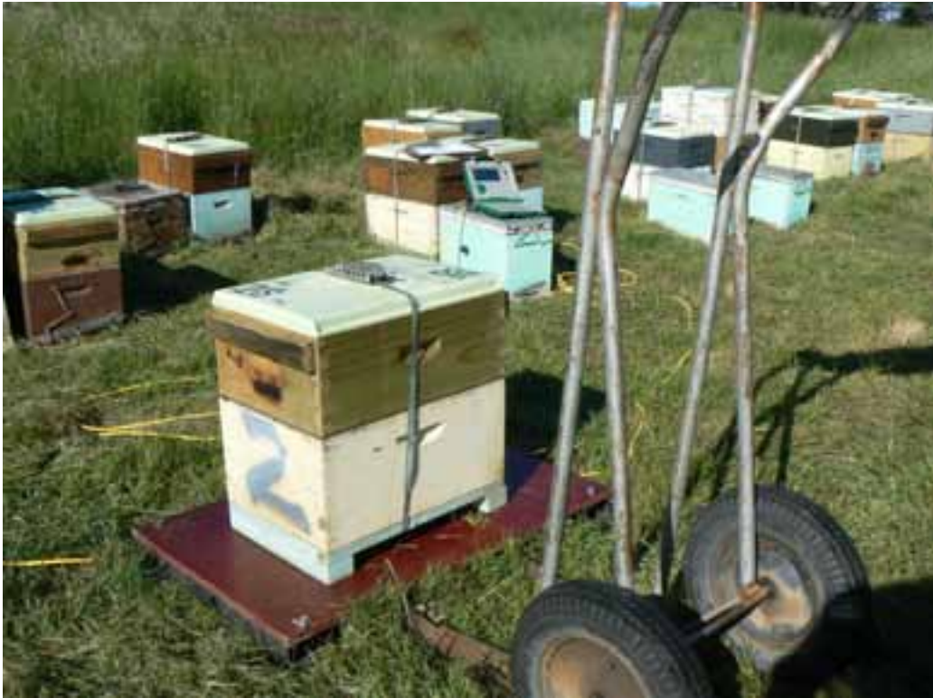
Figure 6 Weighing the hives.

In accordance with the APVMA Guidelines (APVMA 2001) the trial was conducted during a rich honey flow. Paterson's curse was flowering prolifically in the Cootamundra area and bees remained active throughout the six weeks long trial. After this time the hives were re-assessed for the same indicators of hive health (frames of bees, hive weight and area of brood) as before. During the trial period when honey productivity was very high, some hives needed to be re-suppered to accommodate the stores of honey. Supers of known weight were used so that comparison of the pre- and post-treatment weights of the hives (which approximated the yield of honey) could include a correction for the weight of the added empty supers. At the completion of the trial the same two central frames that had been installed in each super but now with drawn comb and full of honey, were removed from the six hives, uncapped and extracted using a manually driven, three-frame rotary extractor (Figure 7).