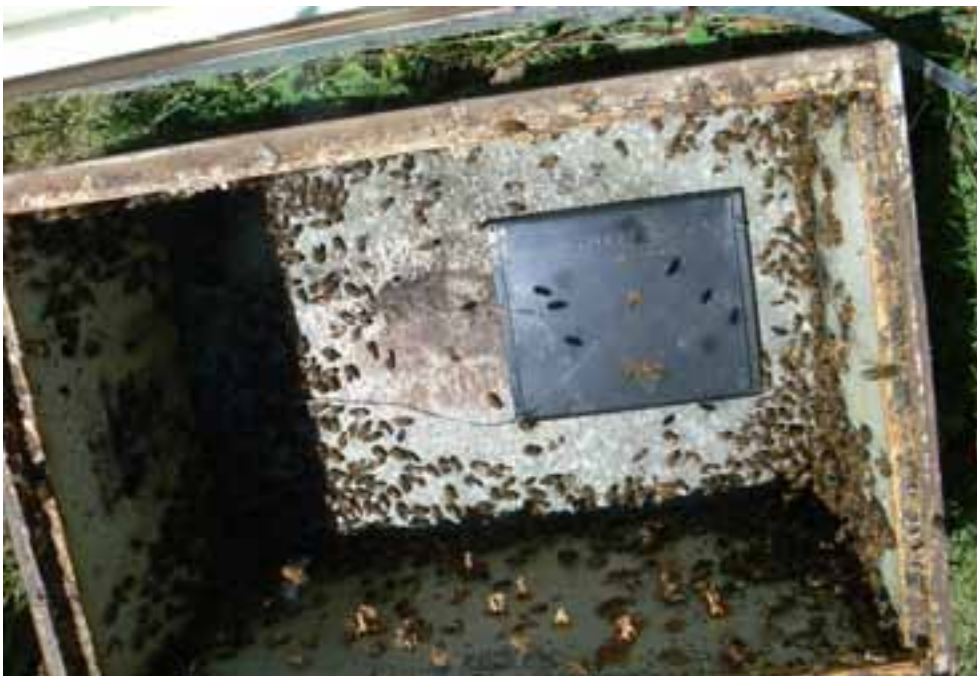
Figure 5 APITHOR™ installed on the bottom board of one of the hives used in the residue trial.