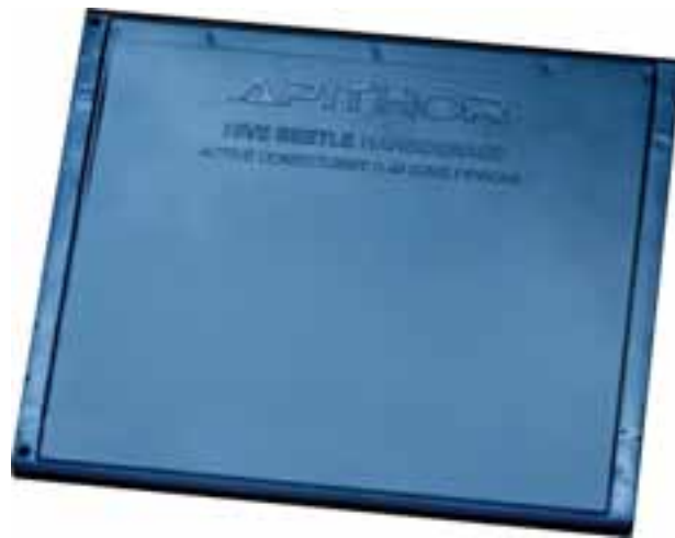
Figure 1 APITHOR™ small hive beetle harbourage.