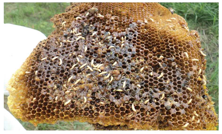
Fig. 1. A "slimed" honey comb. This comb has been ruined by an infestation of small hive beetle larvae.

HIVE INSPECTIONS: Inspections for small hive beetles can be made on any warm day when the temperature exceeds 70°F. The adults become active at this temperature and crawl about the hive and combs outside the bee cluster/brood area. If a hive has a significant infestation, beetles will be observed on the underside of the top cover when it is removed, or inside the inner cover. The adults seek out dark secluded areas; therefore, upon inspection remove the hive cover, smoke it heavily (beetles do not like smoke and will run or even fly away from it) and let the light penetrate into the hive as much as possible. Smoke each subsequent super or brood chamber and remove it after a few minutes. The beetles will easily be seen on the bottom board once it is exposed, and they can be exterminated in a bucket of soapy water. Since adults cause