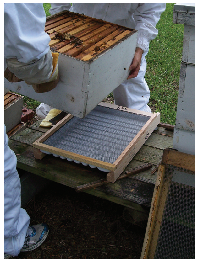
Fig 8. Installing a bottom board hive beetle trap. A tray filled with a killing agent (such as oil or a detergent solution) replaces the regular bottom board. Adult small hive beetles, seeking refuge from the bees, fall into the tray and drown. Hives must be kept extremely level for these types of traps to be effective. Bottom traps also help to eliminate varroa mites that may fall from the bees, as with standard screen bottom boards. The collection trav can be temporarily replaced with a sticky board to monitor varroa mite levels.

which is filled with killing agent (Fig. 8). Bee hives must be placed on a level surface when implementing bottom board traps. Internal hive traps fit within, on top of, or between frames. They tend to be less expensive, but have a much smaller capacity for beetles and need to be serviced more frequently.