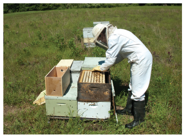
Fig. 9. Making splits. Dividing existing colonies can be an effective way to increase bee stocks, but the beekeeper risks creating colonies that are potentially too weak to withstand heavy SHB infestations.

AN ANECDOTE: Too many combs of brood, pollen and honey can present a problem when making splits. In one case, observed by one of the authors, a split was inspected on a Saturday to see if the queen cell had hatched properly. At that time, the colony had no signs of SHB larvae, and only a few adult beetles were present. The colony contained 5 frames of honey and 3 frames of brood. The following Monday, the split was slimed out. Resident bees (2-3 lbs.) had swarmed to a nearby bush and hundreds of SHB larvae were crawling about the hive. The swarm, which contained a virgin queen, was collected, moved to another location and given new combs with less honey to protect. Fortunately, due to the beekeeper's immediate action, the colony recovered. The split had been made around July 1st and was from one of about 30 that were slimed out. This anecdote illustrates the challenge of making splits late in the season, but they can be made successfully, using plenty of bees and a minimum brood and honeycombs.