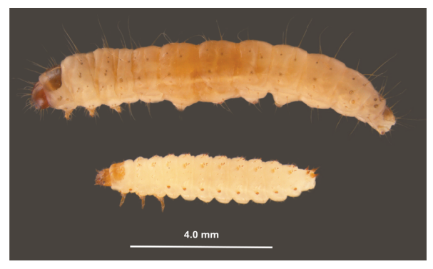
Fig. 3. Larval pests of the bee hive. Wax worm larva (top) and small hive beelte larva (bottom) may be confused by the beekeeper. Both species take advantage of weakened colonies, and both may be found infesting the same hives.

small spines along their backs, while the wax worm is sparsely covered with long hairs. SHB have six legs located near the head, while wax moths have eight prolegs along their body, in addition to the six legs near the head. The abdominal segmentation is much more pronounced in hive beetle larvae. Perhaps the most obvious distinguishing characteristic is the webbing produced by tunneling wax worms. Hive beetle larvae do not spin webs or make cocoons in the combs as wax worms do. There is also an enormous size difference in the mature larvae of both species. Prior to pupation, SHB larvae may reach lengths of 9.5 mm (3/8") and diameters of 1.6 mm (1/16"), while wax worms may grow to be over 20 mm long (7/8") and 6.5 mm (1/4") across. The size of the mature larvae of both species can vary depending on environmental factors such as nutrition and temperature.